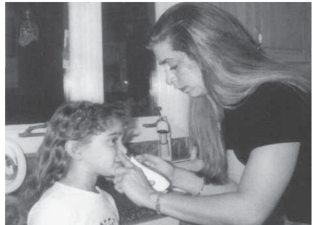
Figure. The parent inserts the tip of the modified Politzer device into one nostril while she compresses the other nostril with her finger.

The planned duration of treatment for the former control group was 7 weeks. The patients in the extended-treatment group (who had already received 7 weeks of treatment) were